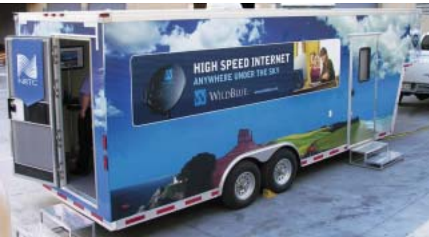
"Speedy," the WildBlue Internet trailer used to demonstrate WildBlue, will be on hand. Stop in and see for yourself how good WildBlue Internet service is.